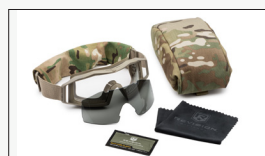
U.S. MILITARY KIT - TAN499 MULTICAM