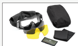
DELUXE KIT - BLACK

*The high-contrast specialty lenses are not approved for military use by the U.S. Army.