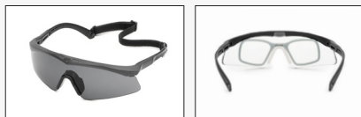
SAWFLY BASIC SOLAR