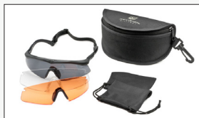
SAWFLY DELUXE VERMILLION KIT