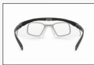
OPTIONAL RX CARRIER