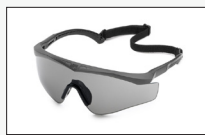
SAWFLY MAX-WRAP BASIC

Laser, polarized and other specialty lenses available by special order.