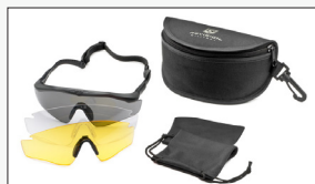
SAWFLY MAX-WRAP DELUXE KIT