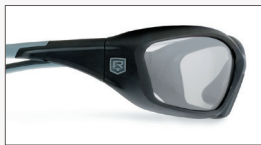
BLACK FRAME CLEAR LENSES 4-0491-0001