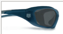
STEEL BLUE FRAME SMOKE LENSES 4-0491-0006